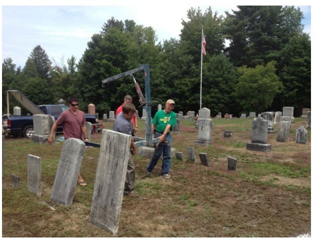
The group being very careful trying not to disturb the old headstones around Asael's