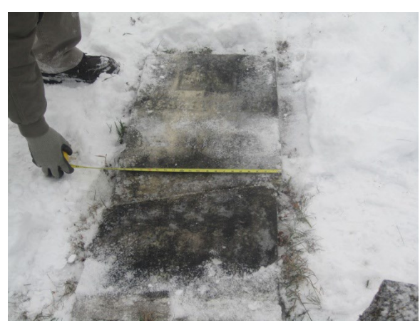
Measuring the original headstone January 06, 2012

measurements of the stone in January of 2012. They spoke in person to Bruce Winters with the cemetery to make sure the family's plan was feasible.