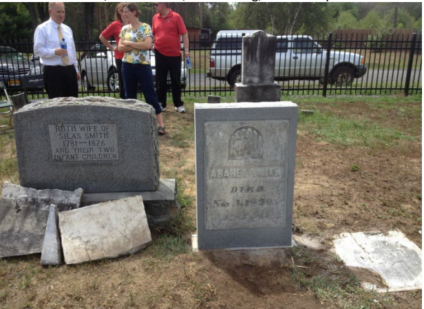
The new Asael Smith headstone encasing the old one