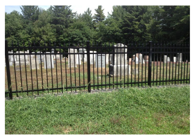
A view of the new headstone from the street