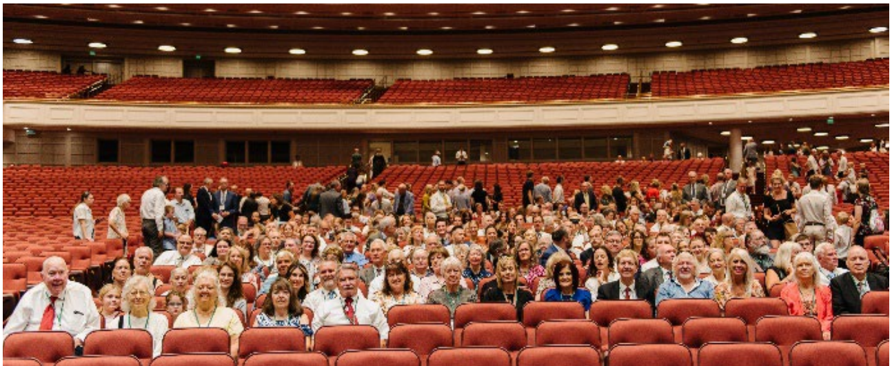
Smith Family Group at Music and the Spoken Word – August 4, 2024

[1] “Latter-day Counsel: Excerpts from Addresses of President Gordon B. Hinckley,” Ensign?Oct. 2000, 73.