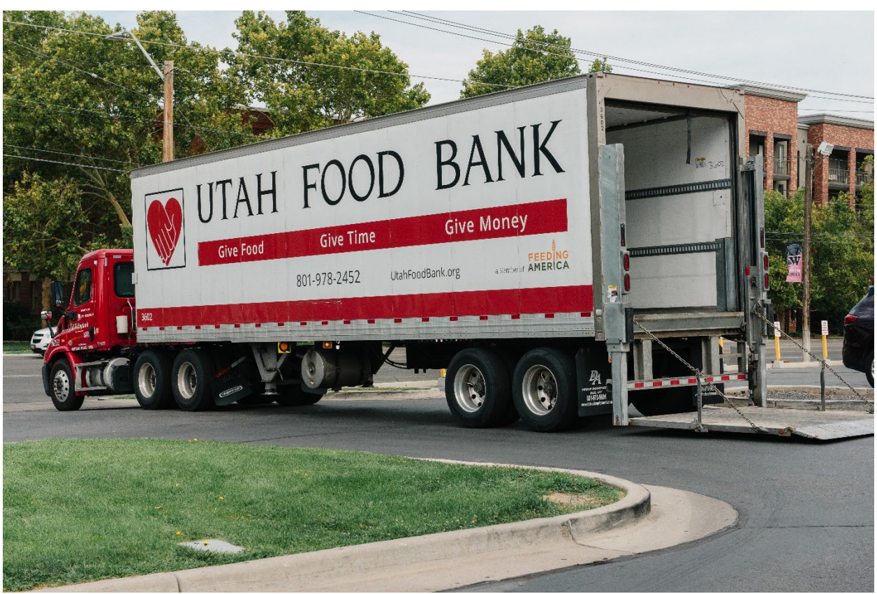
The Food Bank Truck delivered the gaylords to put all the cases of macaroni and cheese inside