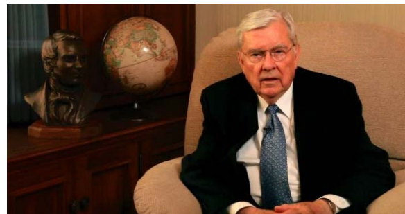
A recorded audiovisual message of unity and friendship was given by Elder M. Russell Ballard