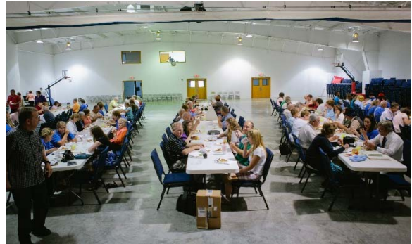
A view from the stage looking out over the family banquet