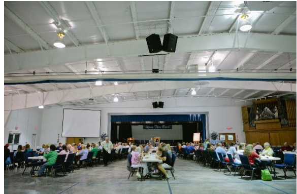
Looking toward the stage