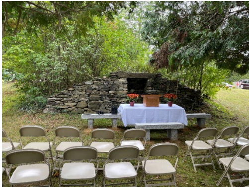
The Nashua New Hampshire Stake set up a beautiful scene at the Centennial Cemetery