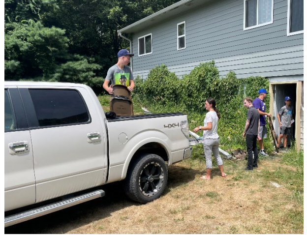
Near the end of the chairs