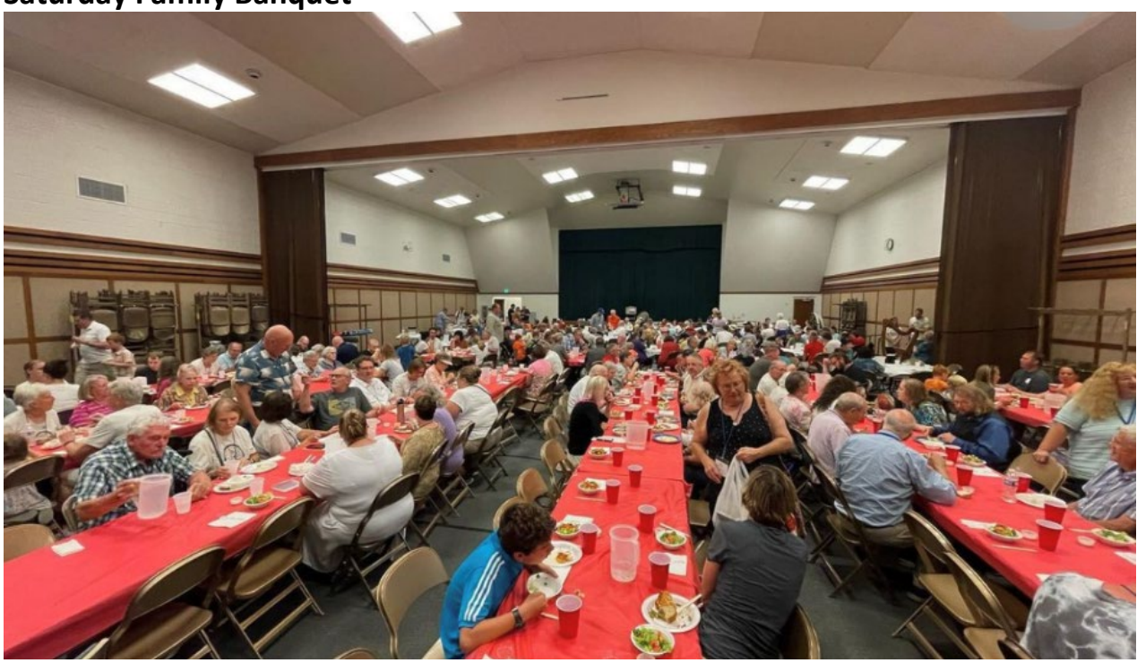
The family had a lasagna dinner with lots of time to visit