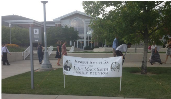
The University of Utah Institute Building in Salt Lake City was where registration was held

August 1, the Smith family check-in and registration began at the University of Utah's Institute Building in the East Multi-Purpose Gym from 4:00 – 7:00 pm.