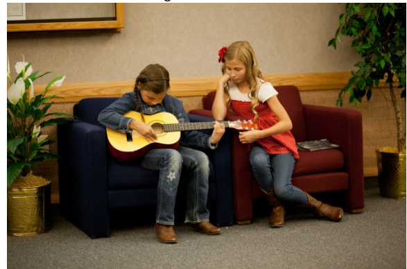
Cousins spending time together