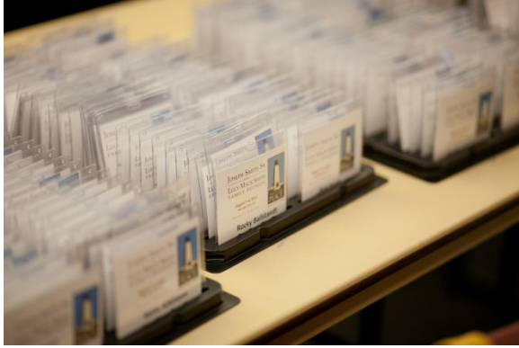
With all the people who attended we had tables full of nametags and registration materials