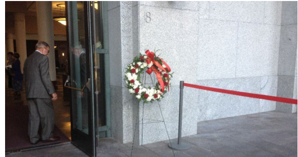
The family was asked to meet and enter at door eight of the Conference Center before Music and the Spoken Word - the wreath made by the youth was displayed