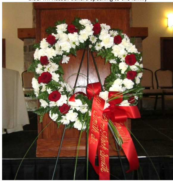
The flowers on display during the family fireside with Elder Ballard