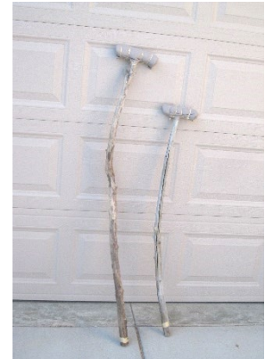
The garage door serves as size scaling