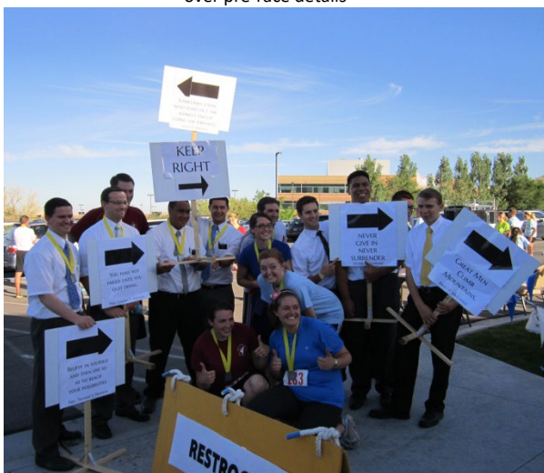
Missionaries from the Salt Lake Mission came and helped provide directions during the race