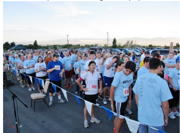
The participants begin to gather at the starting line