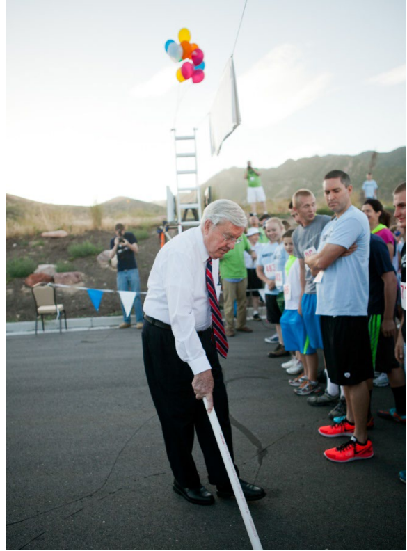
Elder M. Russell Ballard instead of drawing a line in the dirt with a stick drew a line on the asphalt with chalk.