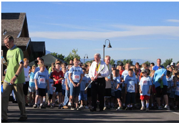
The youth gather to begin the race