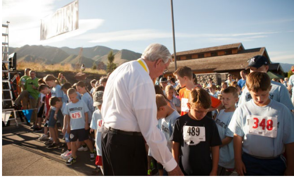
Elder Ballard visited with many of the youth as he prepared to start the race.