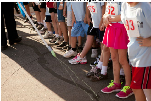
The children and youth lined up at the chalk line