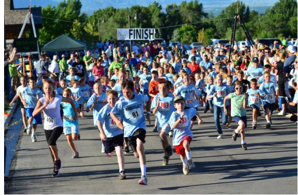
They were off and running