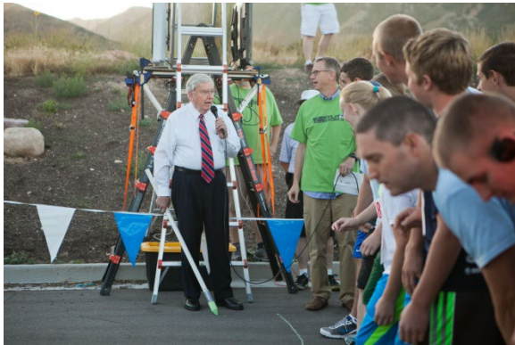
Instead of drawing a line in the dirt with a stick like the movie clip, Elder M. Russell Ballard drew a line on the asphalt with chalk. He said a few words to the group and repeated what the actor playing Joseph Smith used in the film, "Ready, Steady, Go."