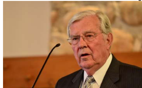
Elder M. Russell Ballard