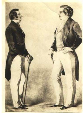
HYRUM AND JOSEPH SMITH Killed by a mob June 27, 1844 at Carthage Ill.

Katharine's older sister, Sophronia, and younger sister, Lucy adored their brothers, and honored their names to the end of their lives.