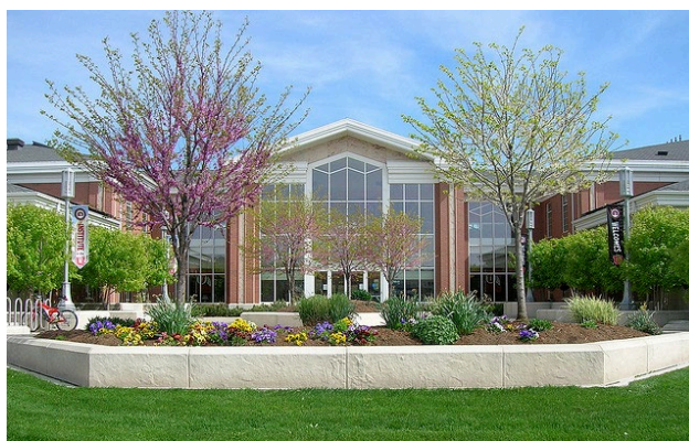
U of U Institute Building

4:00—7:00 pm..... Check-in, Registration