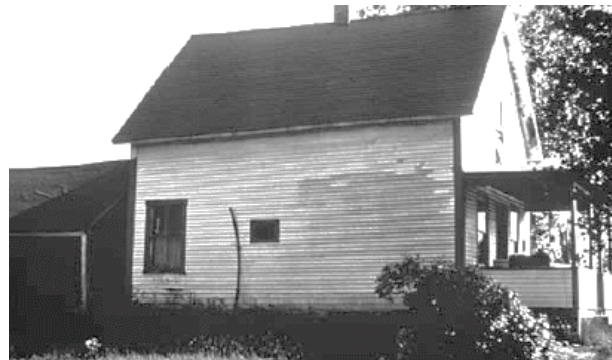
In 1811 the Smiths rented a farm in West Lebanon, New Hampshire. This home was identified as the Smiths' residence. It was torn down in 1967.