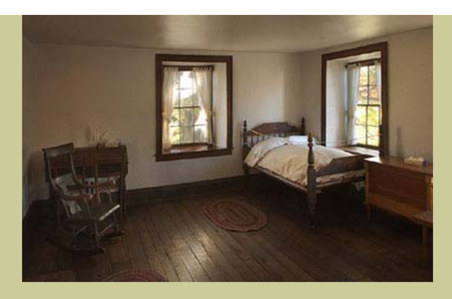
The jailor's bedroom on the second floor of the Carthage Jail

It was some time after five o'clock when a large band of men, with painted faces to hide their identities, swarmed the jail. No resistance was given from the guards. One group of men entered the main door of the sandstone building on the south side and began to rush up the stairs to where Joseph, Hyrum, Willard, and John being held.