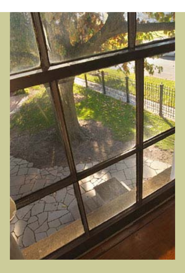
View from second-floor window where Joseph Smith fell, photograph by Val Brinkerhoff, 2004