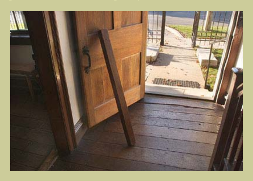
The main entrance to the Carthage Jail

It was some time after five o'clock when a large band of men, with painted faces to hide their identities, swarmed the jail. No resistance was given from the guards. One group of men entered the main door of the sandstone building on the south side and began to rush up the stairs to where Joseph, Hyrum, Willard, and John being held.