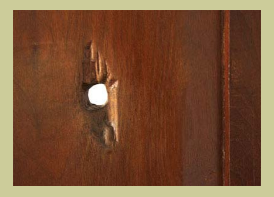
A bullet hole in the bedroom door of the jail, photograph by Val Brinkerhoff, 2004

At the time of the onslaught, the prisoners had only a couple of walking sticks and pistols to protect themselves. Hyrum was shot first. Joseph fired into the crowd through the open door, hoping to keep them at bay. However, there was only a moment of pause in the attack before it continued, increasing its deadly fire.