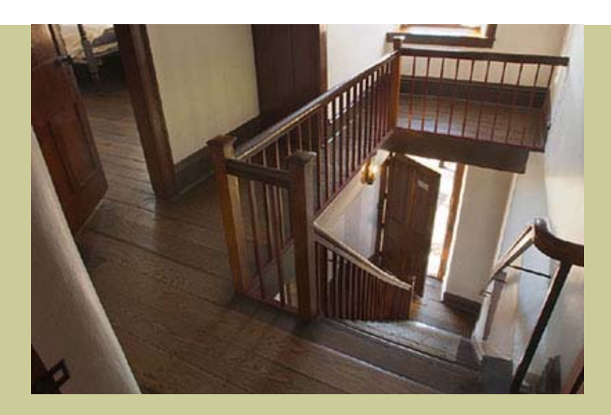
A view of the jailor's bedroom door (left), the second floor landing, and the stairway leading down to the front door, photograph by Val Brinkerhoff, 2004