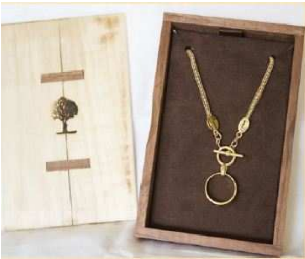
This 14k necklace was produced and given to the family. It holds a reproduced ring of Joseph's and the signature of Emma and Joseph. It is knit together representing each of the Joseph Jr. descendants. The wood box is made from Vermont sugar maple and from Pennsylvania black walnut. One representing the common tree on the Vermont mountain where Joseph was born. The other a familiar tree from the riverside of Emma's birthplace.