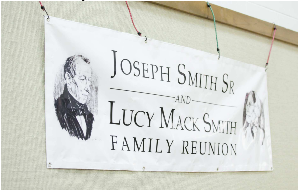
The reunion banner

Registration and check in opened at 6:00. The family had one hour in which to pick up the reunion program schedule, buy t-shirts, visit and have fun. This was a wonderful opportunity to catch up with long lost cousins and share family stories.