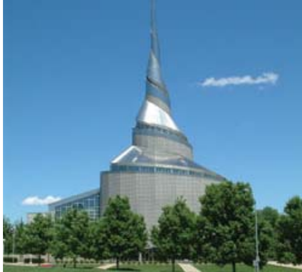
1001 W Walnut St, Independence, MO 64050

Community of Christ Temple & Museum (The museum is located on the ground floor of the Community of Christ Temple)