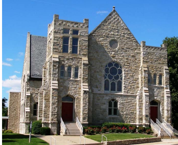
1012 W. Lexington, Independence, Mo. 64050

5:30—6:30 pm..... Check-in & Registration Community of Christ Stone Church