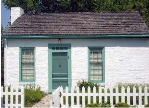
1034 W. Lexington Ave., Independence, MO 64050