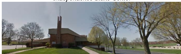
705 West Walnut Street, Independence, MO 64057

12:00 pm—1:30 pm ..... Family Picnic Independence Stake Center