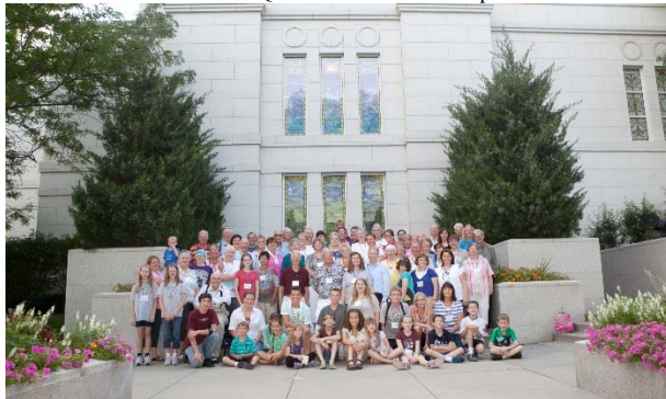
2011 Family Photo by the Winter Quarters Nebraska Temple