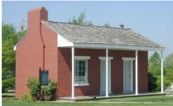
1034 W. Lexington Ave., Independence, MO 64050