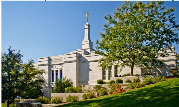
Winter Quarters Nebraska Temple

5:00.....Family Photo in front of Winter Quarters Temple