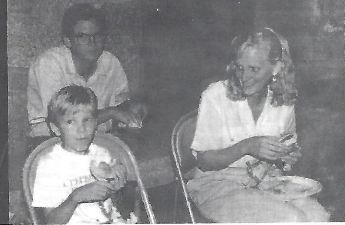
1989 SALT LAKE CITY REUNION MEMORIES