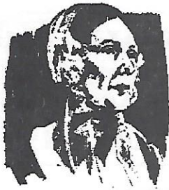
LUCY MACK SMITH 1775-1856