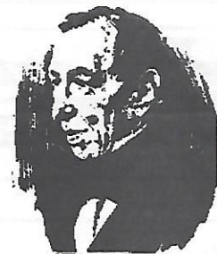
JOSEPH SMITH, SR. 1771-1840