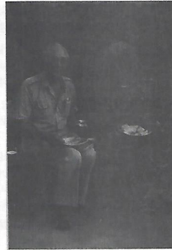
PARTICIPANTS AT THE 1989 REUNION IN SALT LAKE CITY, UTAH