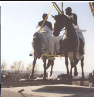
New heroic statues of Joseph and Hyrum riding to Carthage and Martyrdom.