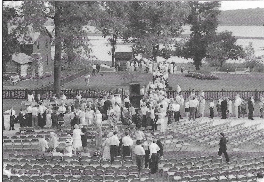
CROWDS GATHER AT NAUVOO SMITH FAMILY CEMETERY PRIOR TO DEDICATION SERVICES.