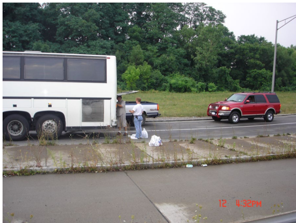
Walt Kolditz, the bus driver, and Jared Younggreen pouring transmission fluid into the bus

Our bus broke down just off the freeway and within a mile of our hotel. Many walked on ahead while the bus had several gallons of transmission fluid poured into it.