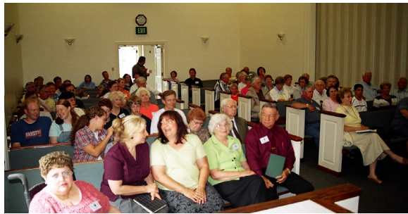
Family gathering in Sharon, Vermont