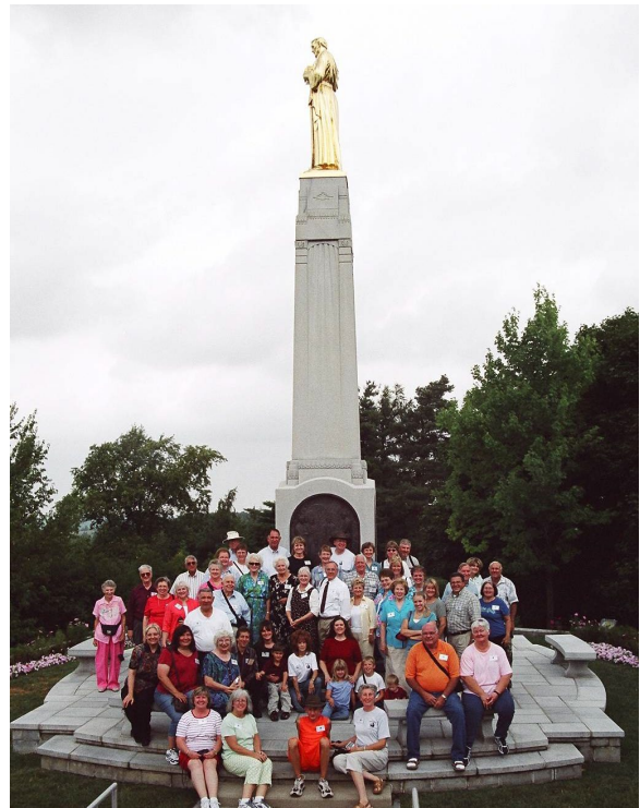
On top of the Hill Cumorah