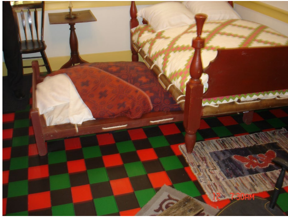
This floor was original to the John Johnson home