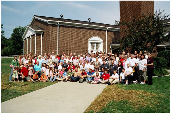
2005 family gathering in Kirtland, Ohio