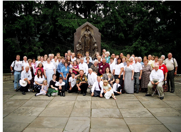
Susquehanna River visit

Sunday, August 14, the group left for Albany stopping to attend Sacrament meeting in Fayette, New York. This gave the family the opportunity to commemorate the 175 th year of the formal organization of the Church.