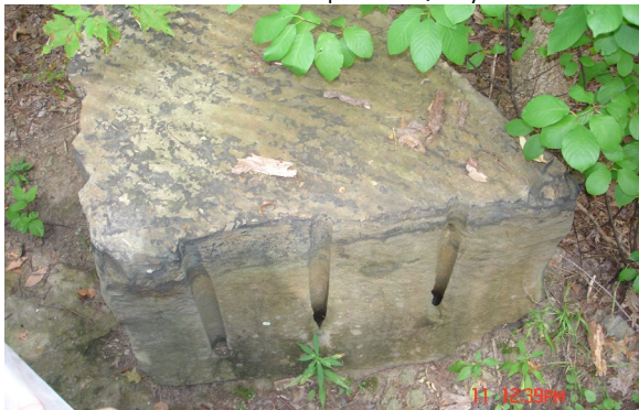
The chisel marks in the rock quarry