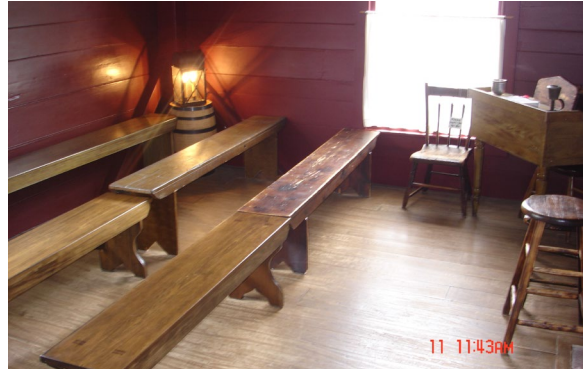
Room in Newell Whitney Store where School of Prophets took place