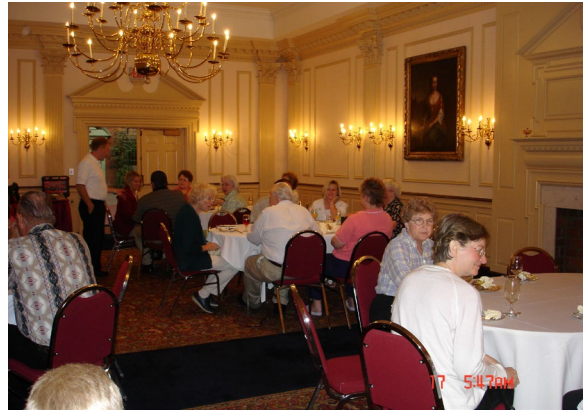
Our family had a nice night's rest and a great send off