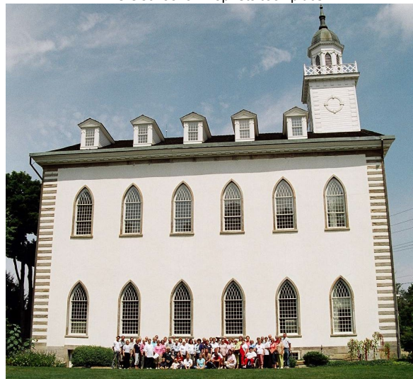
Family gathering after tour of temple