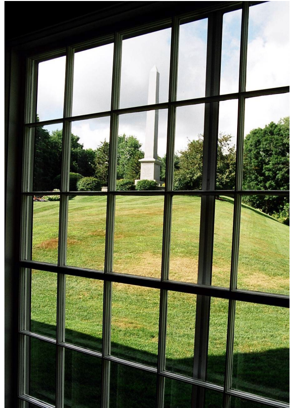
Sharon, Vermont Joseph Smith Monument