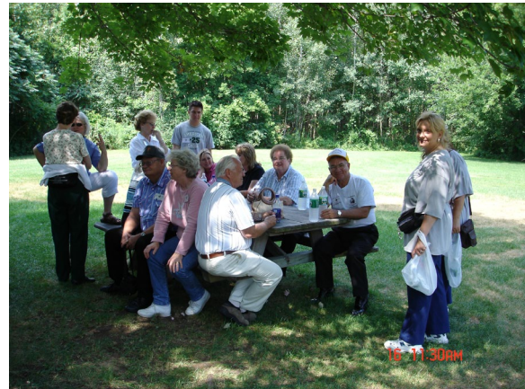
Tired travelers made the best of an awkward situation and enjoyed being together.