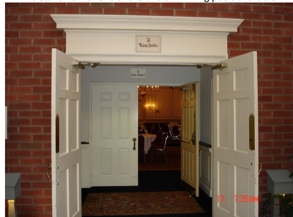
Inside this room we stored our luggage, held our meetings, and had breakfast to say good-byes