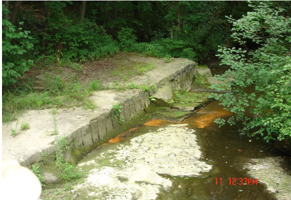
The Kirtland Temple Rock Quarry