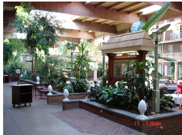
A distant view of one of the two swimming pools available