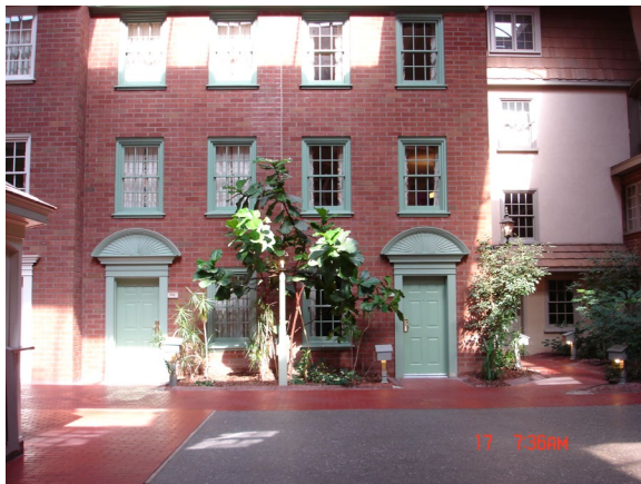
This is an in-door courtyard at the Desmond