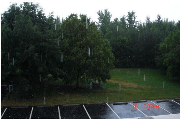
It began to rain and our group stood outside under the walkways with all the luggage

It began to rain hard. Three rooms had been kept for those with physical challenges to have a place to rest.