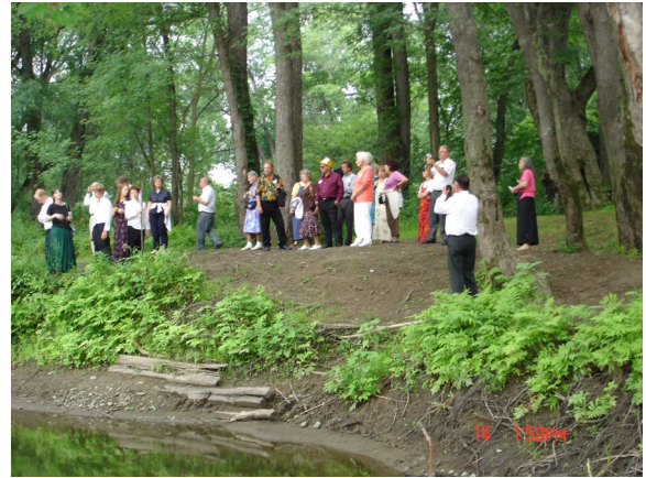
Group standing on banks of Susquehanna River