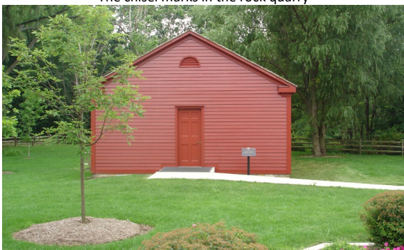
The Kirtland School house