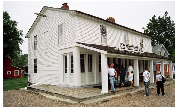
Newell K. Whitney home and store