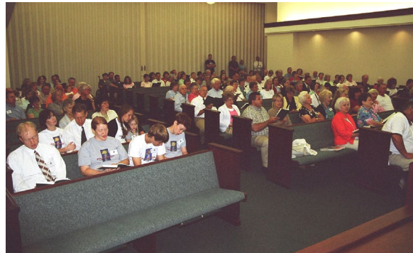
Singing a hymn during the meeting in Palmyra