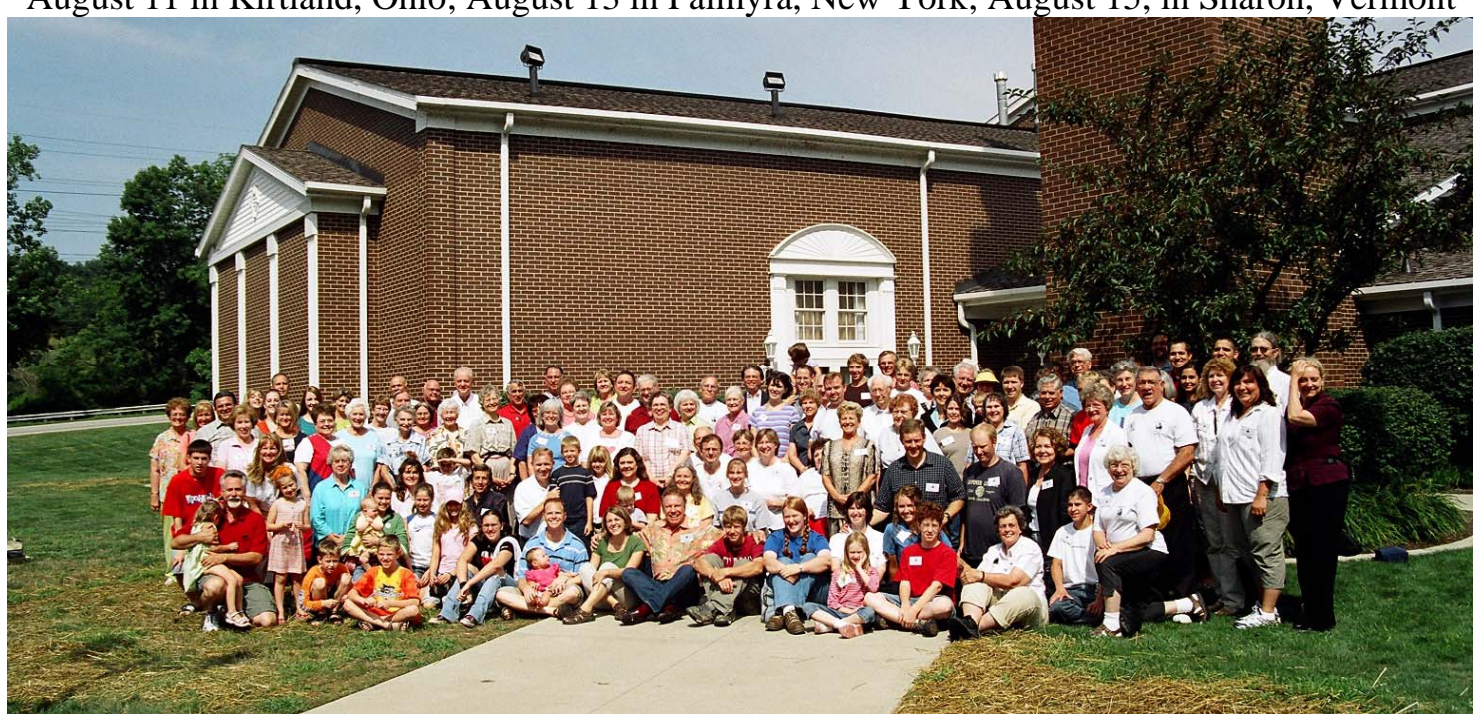
2005 family gathering after a reunion session in Kirtland, Ohio

August 11 in Kirtland, Ohio; August 13 in Palmyra, New York; August 15, in Sharon, Vermont