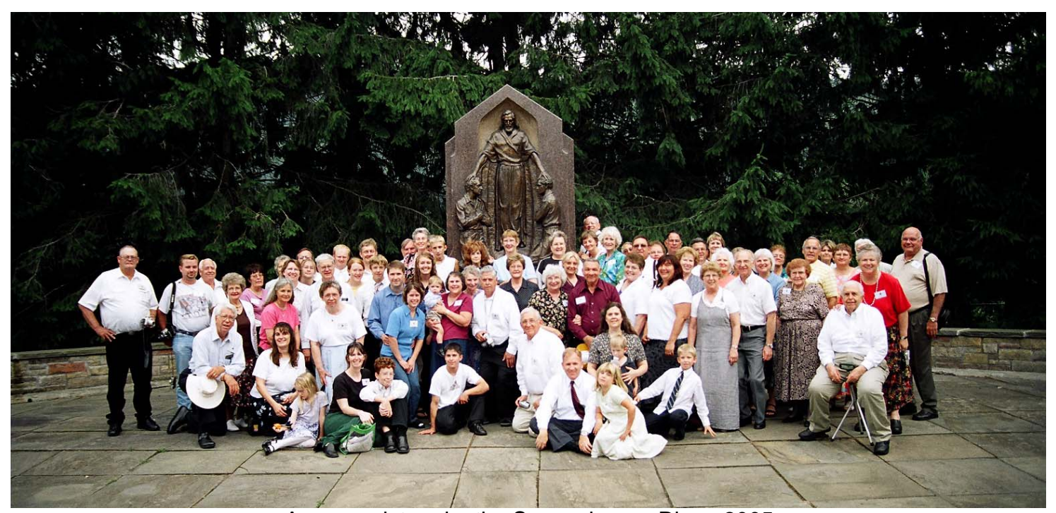
A group picture by the Susquehanna River, 2005