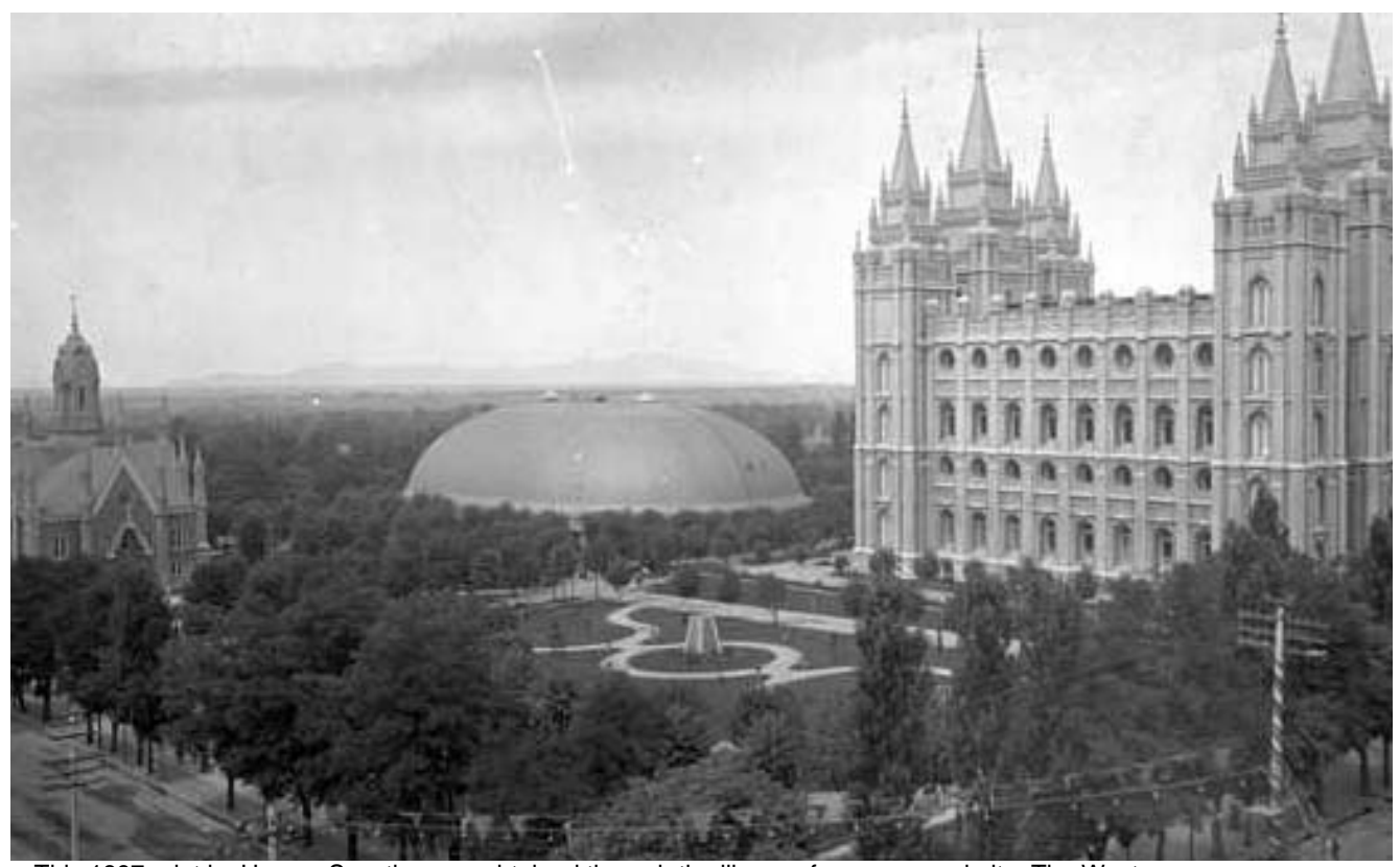
This 1897 print by Horace Swartley was obtained through the library of congress website. The Western History/Genealogy Department, Denver Public Library, which owns the print, wishes this notice. The image itself is public domain. The view is of Temple Square in Salt Lake City, Utah looking North West from the corner of Main and South Temple. The Three primary structures are, from left-to-right, the church-like Salt Lake Assembly Hall, the domed Tabernacle, and the Salt Lake Temple.