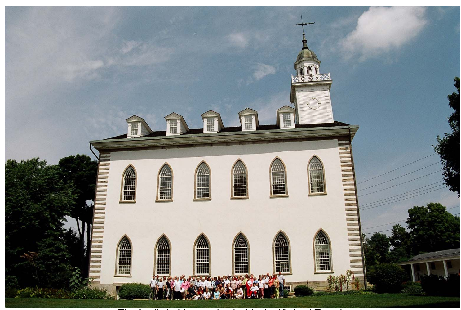
The family held a session inside the Kirtland Temple