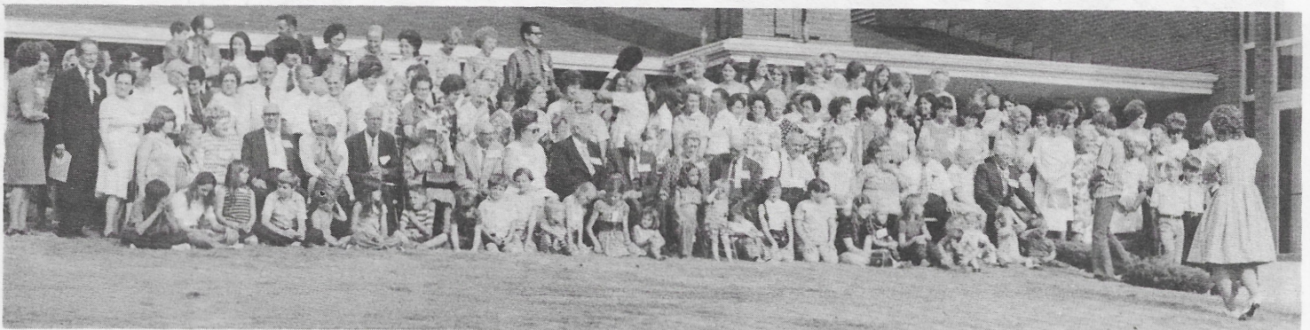
Historic first Family Reunion in Nauvoo in 1972.

Additional reunion highlights include a Friday night dramatic presentation and a Saturday evening banquet. Sunday morning,