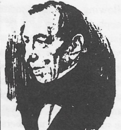
JOSEPH SMITH, SR. 1771-1840