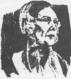
LUCY MACK SMITH 1775-1856