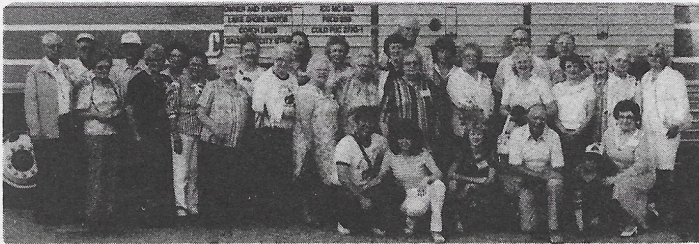
1983 Iowa bound bus tour group.