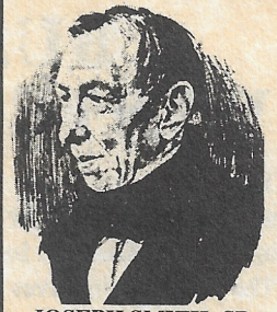
JOSEPH SMITH, SR. 1771-1840