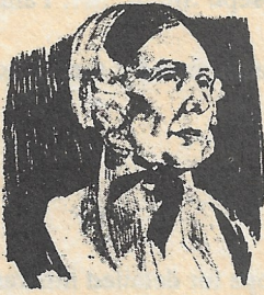
LUCY MACK SMITH 1775-1856