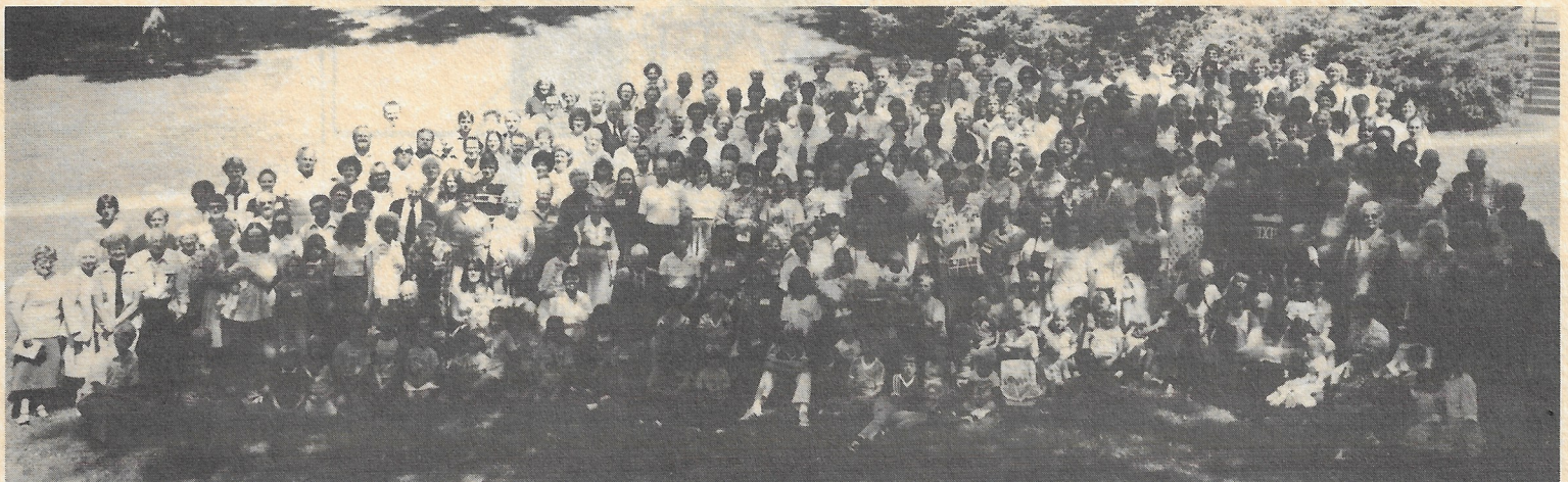
1981 PROVO, UTAH PARTICIPANTS LOOK FORWARD TO LAMONI, IOWA, IN 1983

Since the deadline for registration is June 30th, don't delay. Mail the attached form and fees today. If you wish registration confirmation please include a stamped self-addressed envelope. Otherwise, registration verification will be given between 6 p.m. and 7:30 p.m. July 28th prior to the get-acquainted reception.