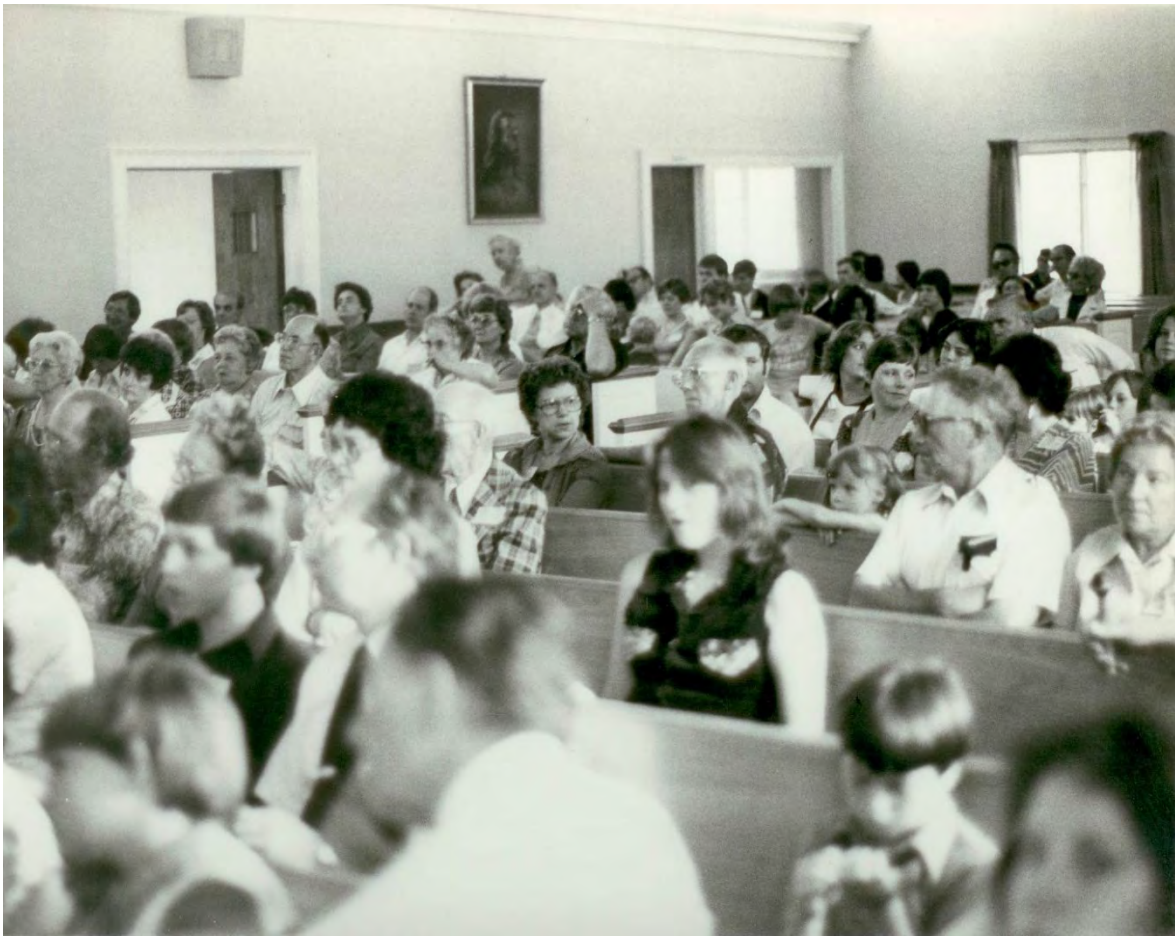
The family gathered during one of the meetings