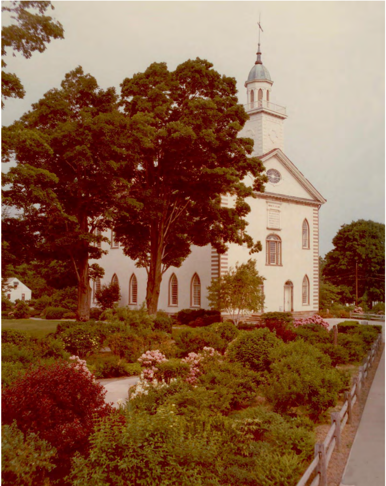
Kirtland Temple