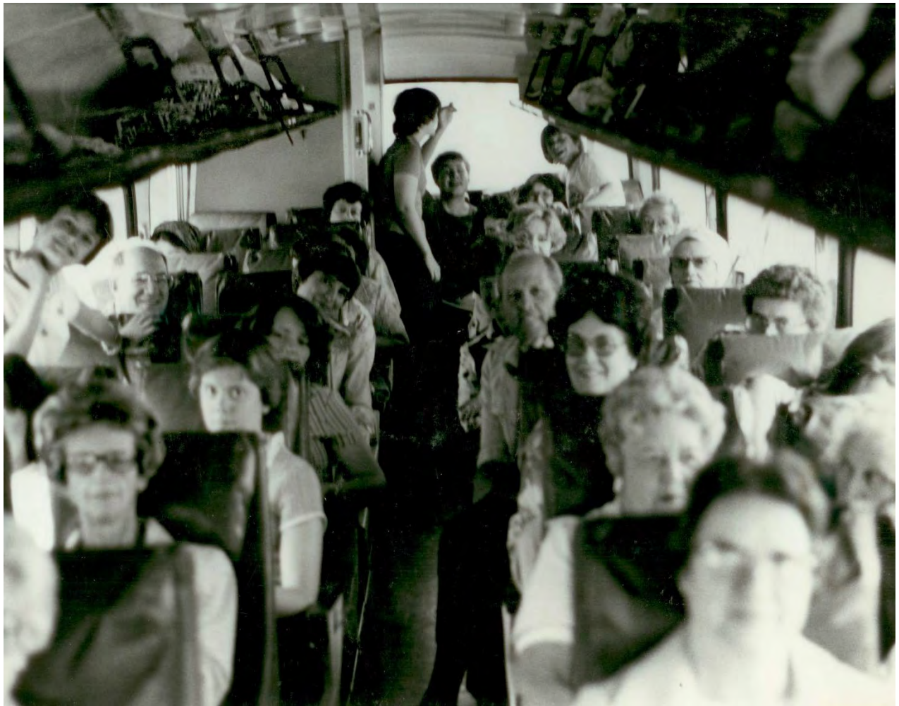
A fun and lively group inside the bus