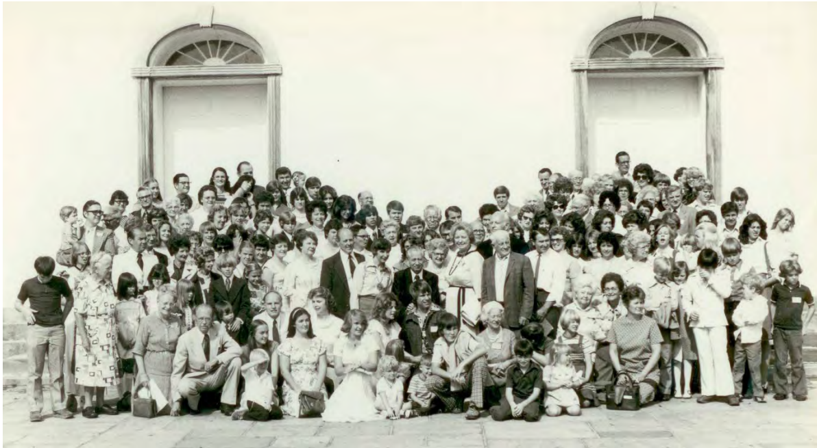
1977 Joseph Smith Sr. and Lucy Mack Smith Family Reunion Group Photo