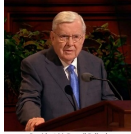
President M. Russell Ballard

Honoring the 200 th Anniversary of the First Vision