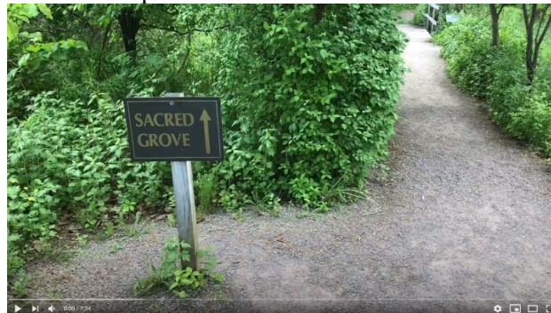
Virtual Sacred Grove from Called to Share

Click on the pictures to watch the below videos: