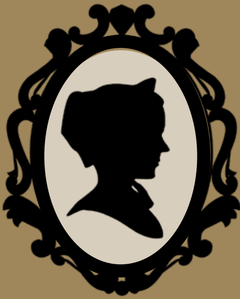
Lucy Mack Smith