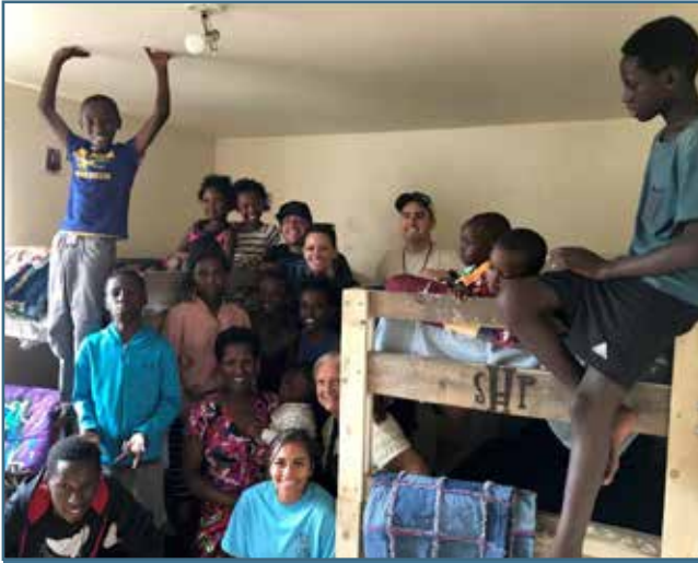
Smith family members and SHP staff deliver beds on August 4 to a family recently arrived from Rwanda.

On August 4, 2018, Smith Family members joined with Sleep in Heavenly Peace (SHP) to provide 200 beds for local refugees and people in need as a way to commemorate