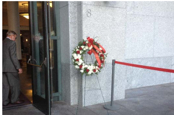
In 2013 we placed the wreath made by the youth during the reunion for our family to see as they went in door eight of the Conference Center before Music and the Spoken Word.

Everyone 8 and older should meet at Door 8 on the west side of the Conference Center (not the Tabernacle) by 9:00 a.m. Parents can take those under 8 to door 2 and be seated in the Little Theater to watch the broadcast.