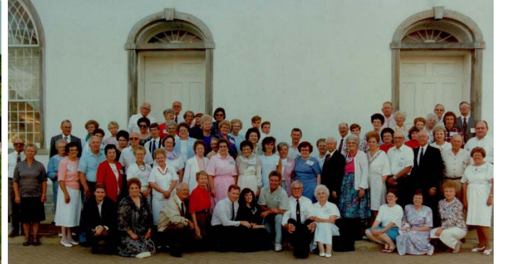
1987 – Kirtland Temple in Ohio