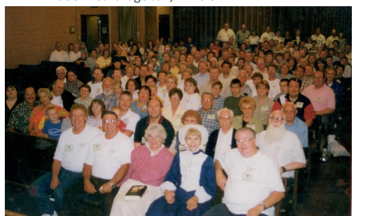
1999 – Nauvoo, Illinois