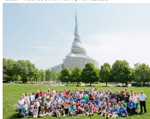
2014 – Independence Temple Lot