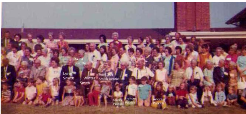
1972 – Nauvoo, Illinois