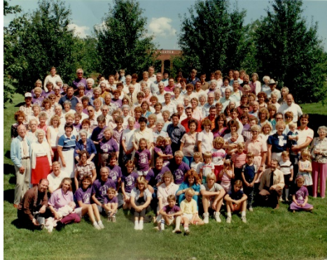
1985 – Nauvoo LDS Visitor's Center