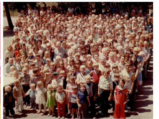
1975 – Salt Lake City, Utah