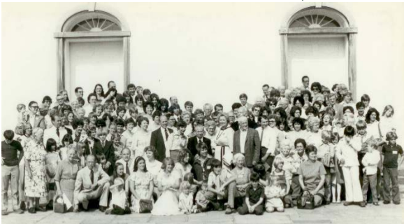
1977 – Kirtland Temple