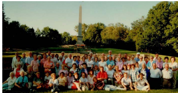
1991 – Joseph Smith Birthplace Memorial in Sharon, Vermont