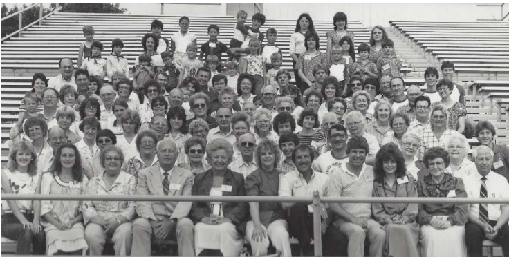
1983 – Graceland College in Lamoni, Iowa