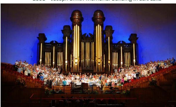
2007 – Salt Lake City, Utah