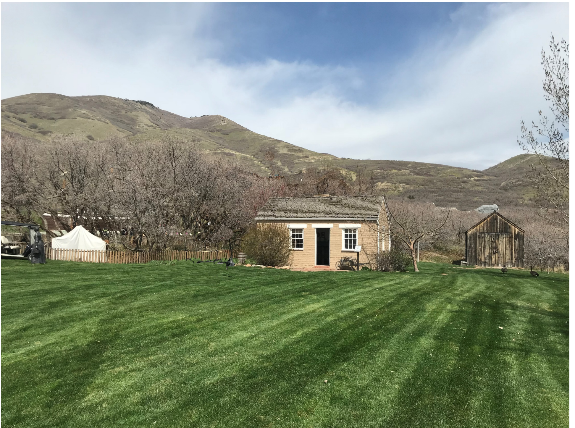
2018 – This Is The Place Heritage Park – Salt Lake