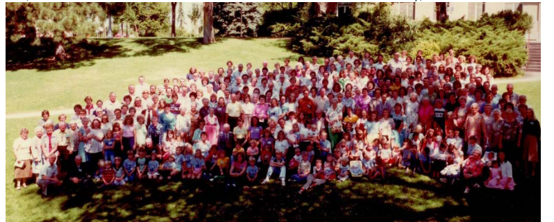
1981 – BYU in Provo, Utah