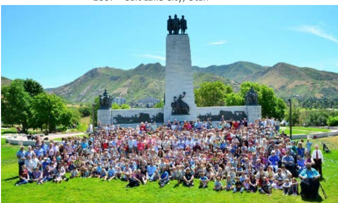
201 – This Is The Place Heritage Park in Salt Lake City