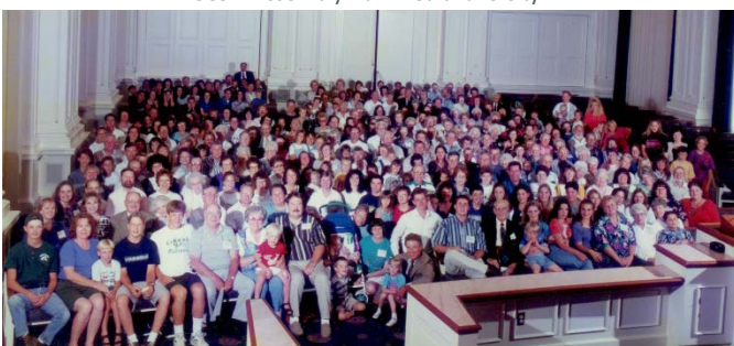
1995 – Joseph Smith Memorial Building in Salt Lake