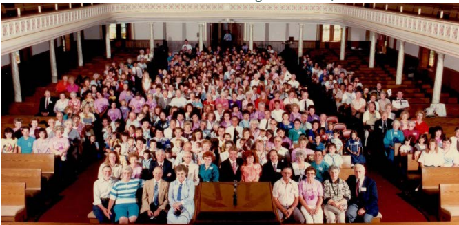
1989 – Assembly Hall in Salt Lake City