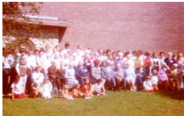
1973 – Independence, Missouri