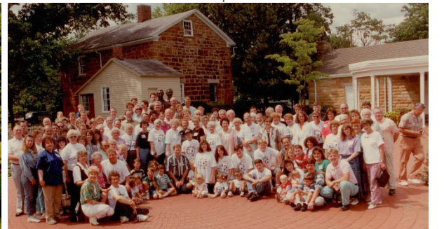
1993 – Carthage Jail, Illinois