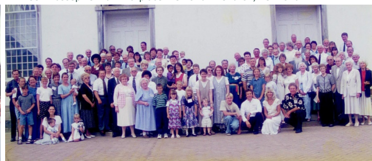
1997 – Kirtland Temple, Ohio