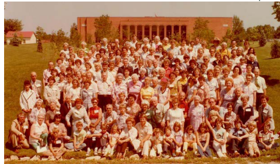
1979 – Nauvoo, Illinois