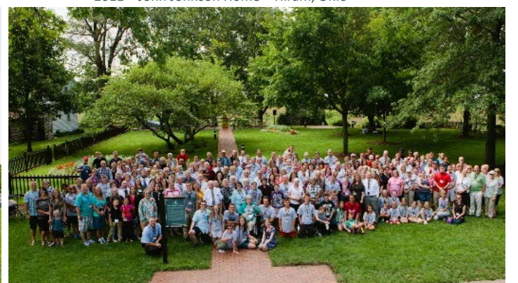
2016 – Nauvoo Smith Family Cemetery