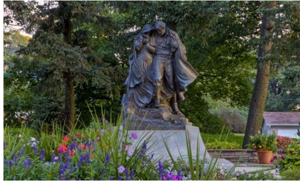
Winter Quarters Mormon Pioneer Cemetery